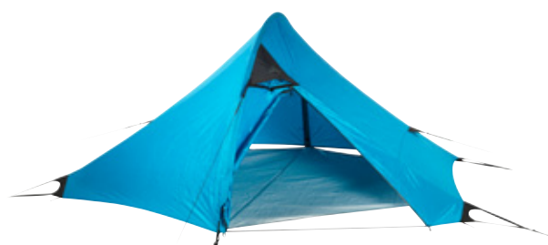
Hexagonal ground sheet optional accessory